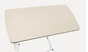
Table top is made of phenolic resin laminate with PVC cover.